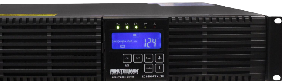
Encompass RTXL EC1500RTXL2U