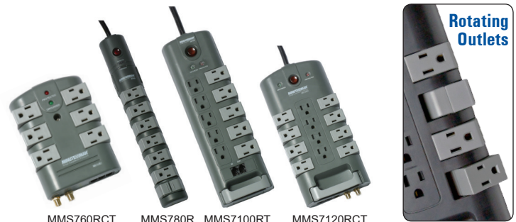
MMS760RCT MMS780R MMS7100RT MMS7120RCT