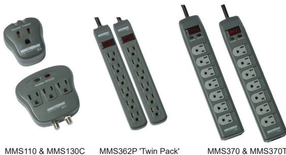
MMS110 & MMS130C MMS362P 'Twin Pack' MMS370 & MMS370T