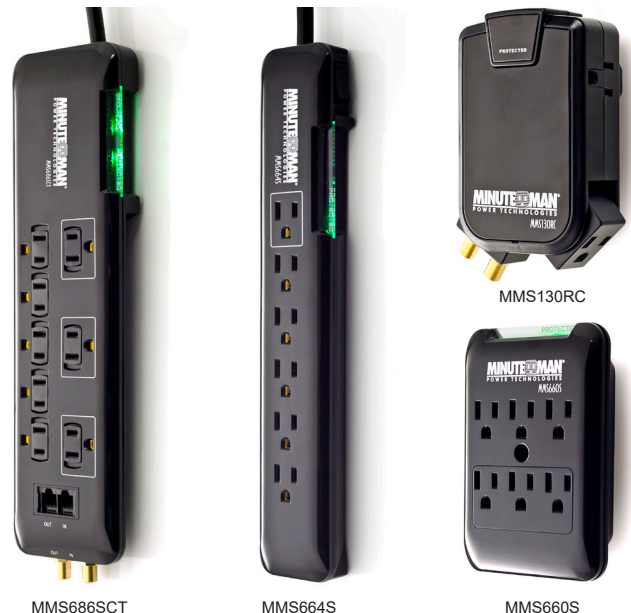
MMS686SCT MMS664S MMS660S

Perfect protection for wall-mounted TVs! Learn more about the slimline series at http://www.minutemanups.com/slimline