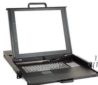
1U Dual-rail Integrated rackmountable 17-inch LCD console (MMKVM17NB2RR). (15-inch single-rail version also available)

Please refer to our separate datasheet on the rackmountable LCD consoles for additional information.