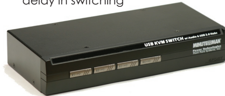
4-port KVM with audio and microphone channel controls (MMAUSB314SK)