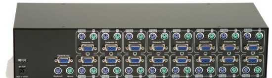
Rear of 16-port PS/2 KVM switch - model MMAKV1680